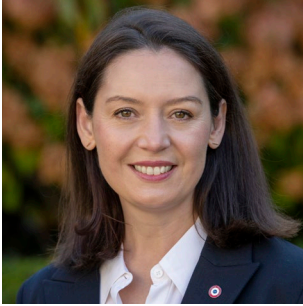
Marie-Pierre Rixain , Member of the French Parliament

The realization and effectiveness of women's economic rights are true opportunities for both men and women, companies, and our economy; they, therefore, require proactive policies and feminist commitments.